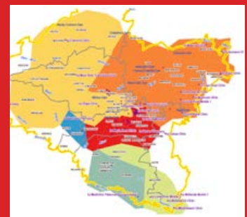
Final output/weighted overlay after it is normalised and averaged, and visualised per sub-district